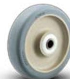
XA Prevenz™ Polyurethane on Polypropylene

The EPA registered and FDA compliant antimicrobial additive used in Prevenz™ wheels is designed to suppress the growth of a variety of destructive and odor causing microbes including bacteria, molds, mildew and fungi. These wheels are suitable for a variety of applications including medical equipment, food equipment, pharmaceutical, chemical, meat & poultry, processing plants and more. To order add "PREV" to end of caster number.